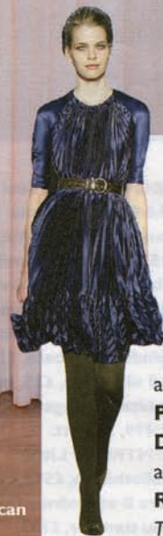
Portrait Suites. Below: Pelican