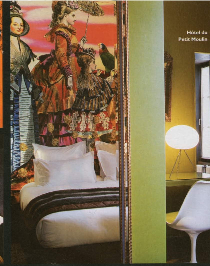
Hôtel du Petit Moulin